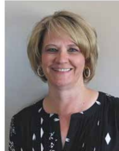
MAYOR DEBBIE WINN

We recently replaced the playground equipment at Linear Park. The equipment was removed about